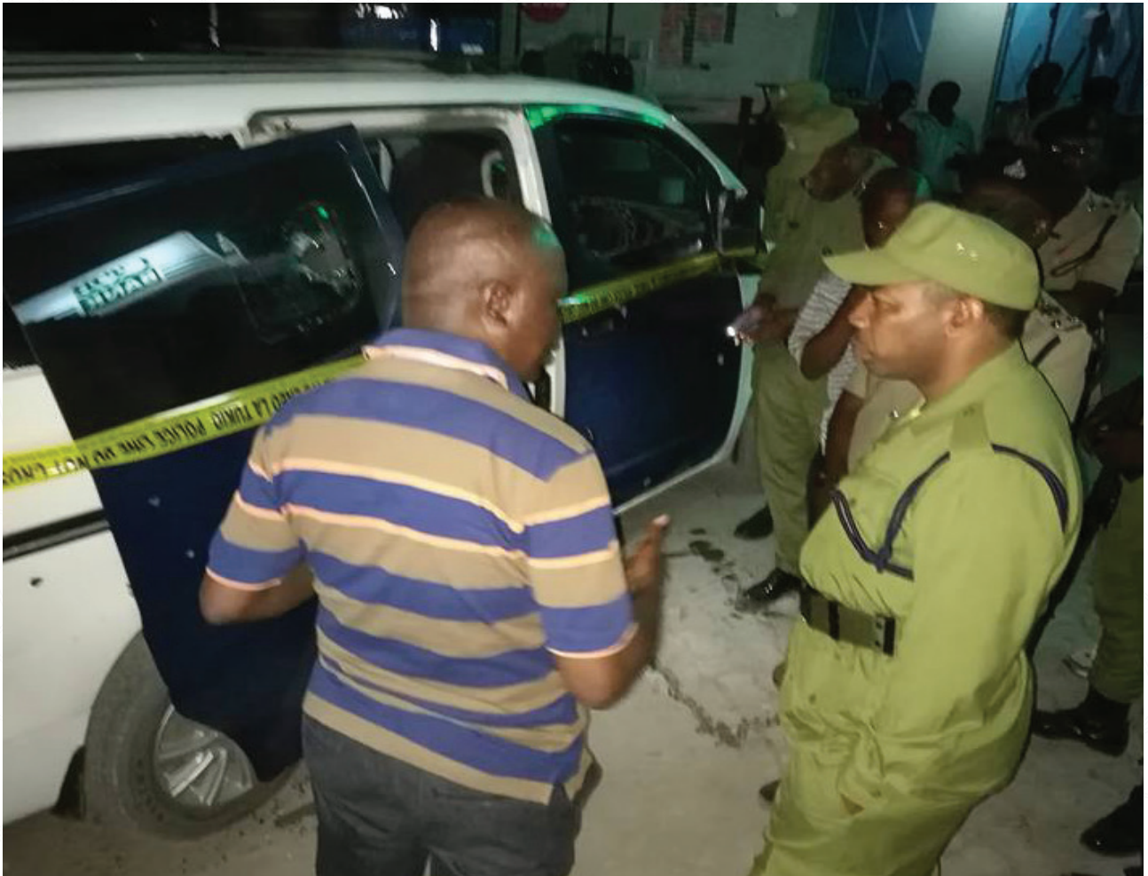
Minister of Home Affairs, Mwigulu Nchemba visiting the site where the four police officers were killed.

Law enforcers in Tanzania are obliged to know and to apply International Human Rights Standards during their operations. Generally, they must respect and protect human dignity, maintain and uphold the human rights of all persons. The Tanzania Police Force (TPF) is statutorily mandated by the Police Force and Auxiliary Services Act 524 to oversee the work of the preservation of peace; maintenance of law and order; prevention and detection of crime; apprehension and guarding of offenders; and protection of property.