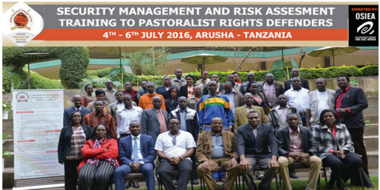
The Group photo of Participants of security management and risk assessment training for pastoralist rights defenders