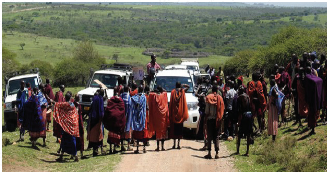
Citizens of Loliondo blocking the Minister for Natural Resources and Tourism to have him listen their concerns about land conflict in Loliondo.