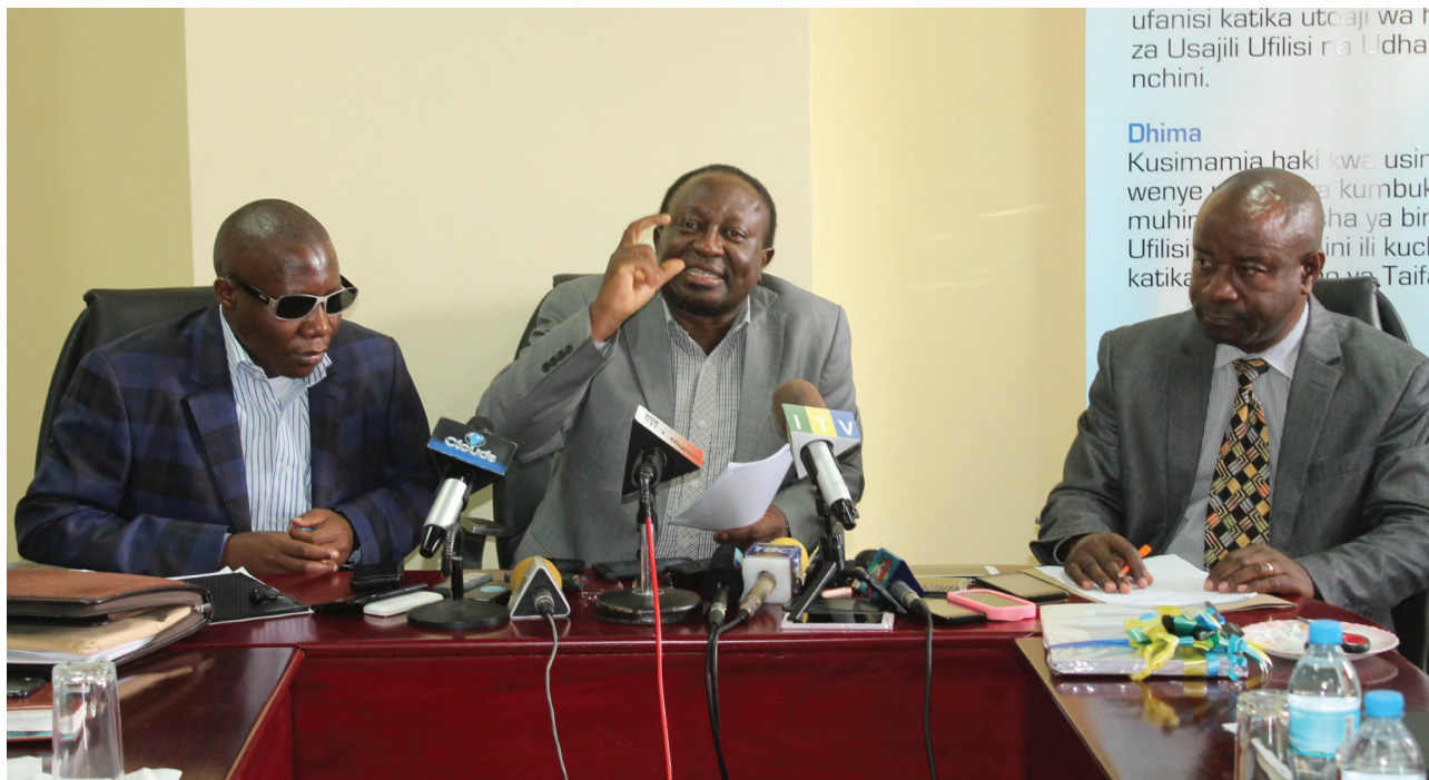
Minister of Constitutional and Legal Affairs, Dr. Harrison Mwakymbe addressing journalists while giving instructions and threats to de-register CSOs which do not comply with the law

Branding of CSOs by government officials is yet another challenge which shrink the space of CSOs. For a long time and repeatedly, various leaders of the government have been quoted as dubbing CSOs bad names. Government leaders views CSOs as source of conflicts rather than solutions to conflicts, puppets of donors and oppositions rather than partners in development.