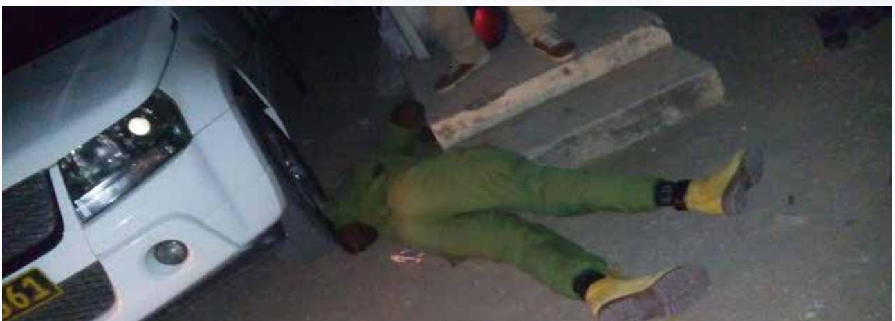
The body of a Policeman who was shot to death by bandits at Sitaki Shari Police post in Dar es Salaam in 2015.

Police officers do receive allegations of human rights violation on a daily basis. Just like other HRDS, they fight all sorts of criminal conducts, brutality, and gender based violence as well as restore peace where the security of people is at risk. It is therefore, very clear that police and human rights actors play almost a similar and mutual role in the field of human rights.