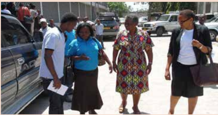
<< Officials from TACCEO at the police station finding out the fate of their observers and working tools.