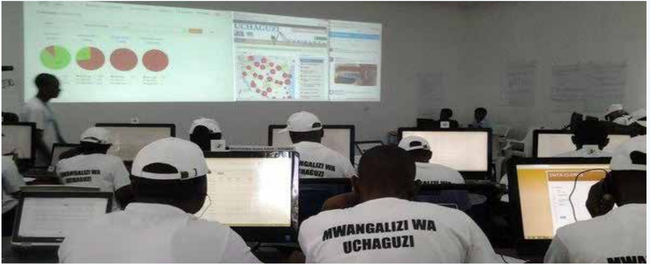
Election observers busy at the TACCEO Election Hub before they faced the wrath of the Cybercrime Act.