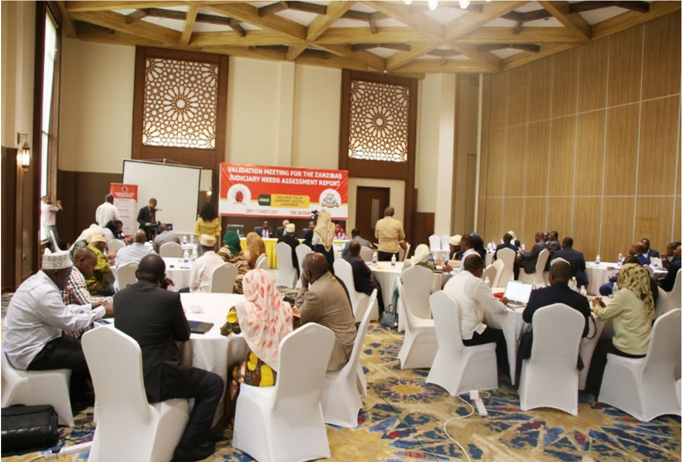
Participants following discussions during the Validation Meeting of Zanzibar Judiciary Need Assessment Report at Golden Tulip Hotel (Airport) on 01st August 2022.