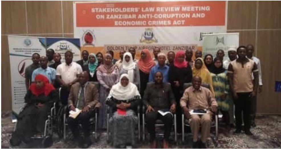
A group photo during the consultative meeting to review and collect opinions on the Zanzibar Anti-Corruption and Economic Crimes Law.