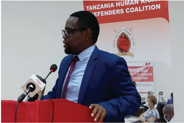
A photo of THRC national coordinator during the event