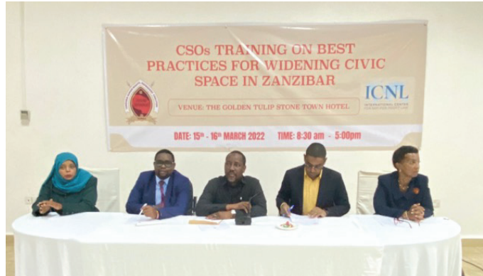
Participants following presentations from facilitators and contributing during the training