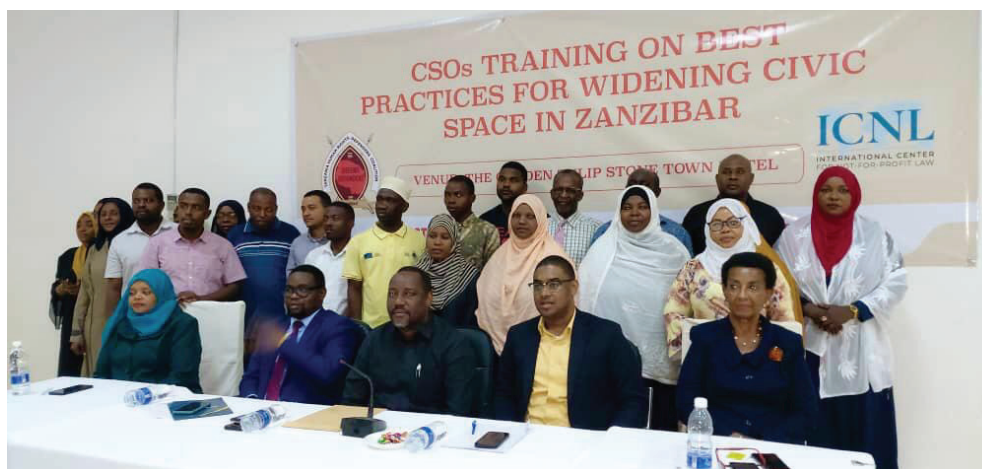
A group photo of some representatives of CSOs together with the Guest of Honor at during the training

The capacity building session focused on how best to monitor and compile human rights reports. Also through session participants were able to discuss the challenges affecting Civil Society Organization (CSOs) in Zanzibar and develop strategies on how best to address those challenges for the well-being of civil society.