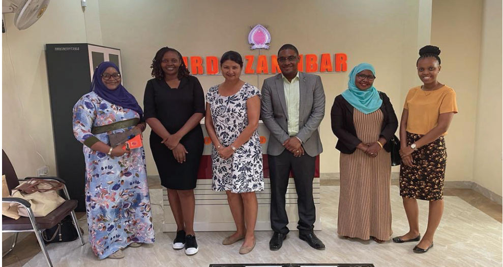
A group photo of THRDC secretariat, board member with a visitor from Swedish embassy at THRDC-Zanzibar office