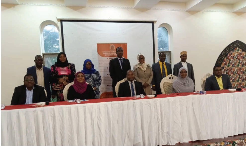
A Group Photo of Zanzibar Judges during the Training

The training was facilitated by a Judge from the High Court of Tanzania Hon. Judge Zahra Maruma. Judge Maruma shared with the participants various best practices and lessons learnt from Tanzania Mainland. Some of key areas for reform include case management in the courts, the use of information technology, ethics of judicial officers, human resource, infrastructure of the judiciary and many other relevant issues that will increase efficiency in the Judiciary.