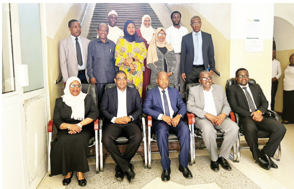
A group photo Judicial officers, THRDC secretariat from Tanzania mainland & Zanzibar and THRDC board members from Zanzibar