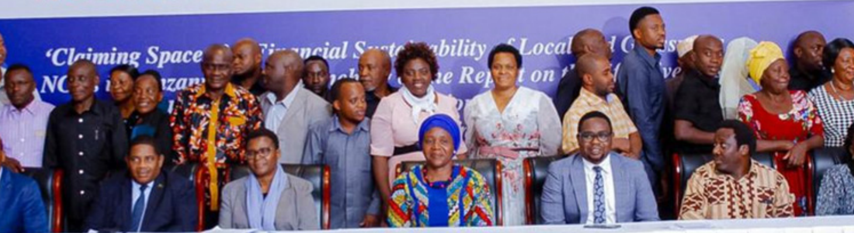
A group photo of Tanzania CSOs Directors together with Minister for Community Development, Gender, Women and Special Groups, Dr. Dorothy Gwajima