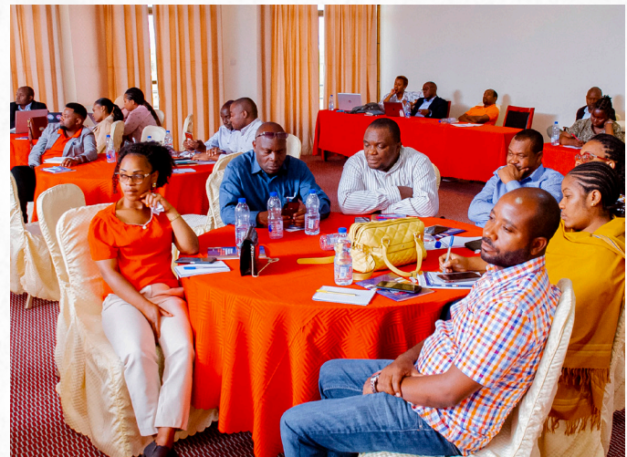
Participants of the meeting following up during the “Financial accountability and sustainability of NGOs” on 2nd October 2022 in Dodoma.